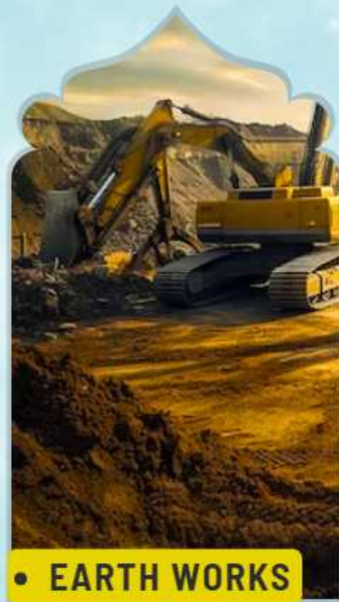
• EARTH WORKS