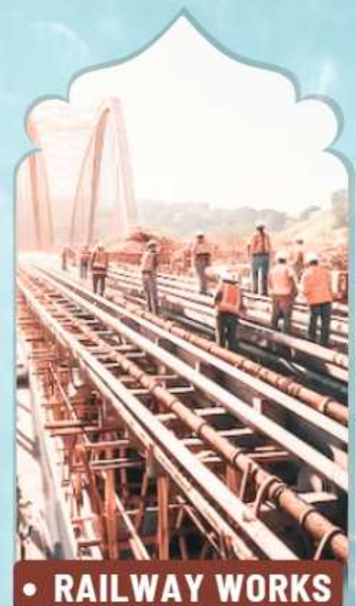
• RAILWAY WORKS